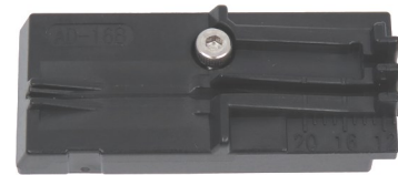
AD-16B Fiber Set Plate without Clamp (Standard)