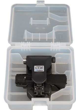
CT16 in Carrying Case